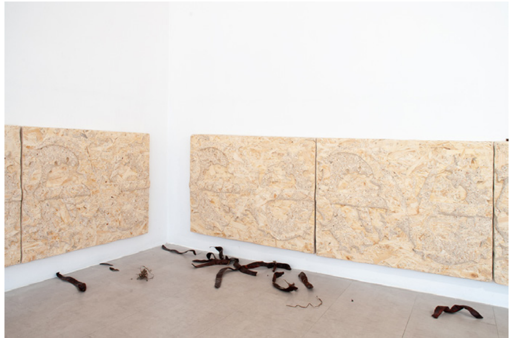
Image description: Installation details from The Heydays from the exhibition with the same name, Galleri CC 2024.