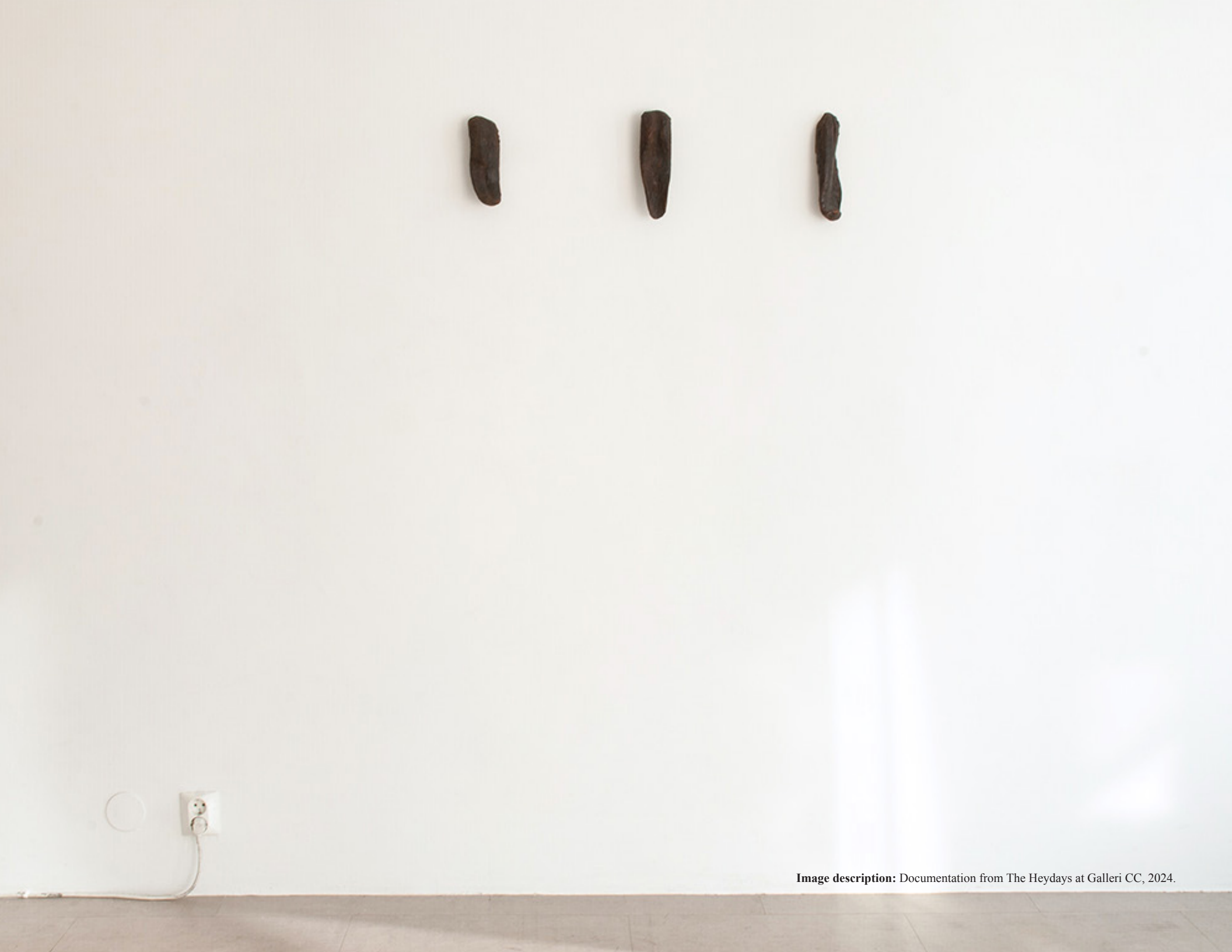
Image description: Documentation from The Heydays at Galleri CC, 2024.