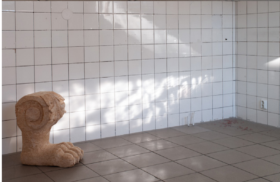
LIONS FOOT, 2024 Venue: Galleri CC, (SE) Info: Sculpture in OSB. Dimensions: ca. 80x40x60 cm