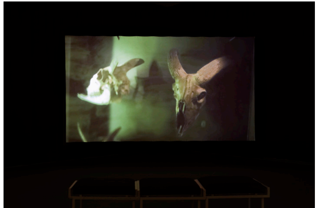
Image description: Installation view from Gävleborgs Länsmuseum where the video was installed alongside a bear skull in a glass cabinet.