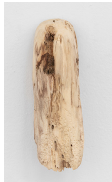
Image description: Interventions in the room included gathered rubbish from the studio floor in the corners of the room and dead flies in the lamp. Tongue III