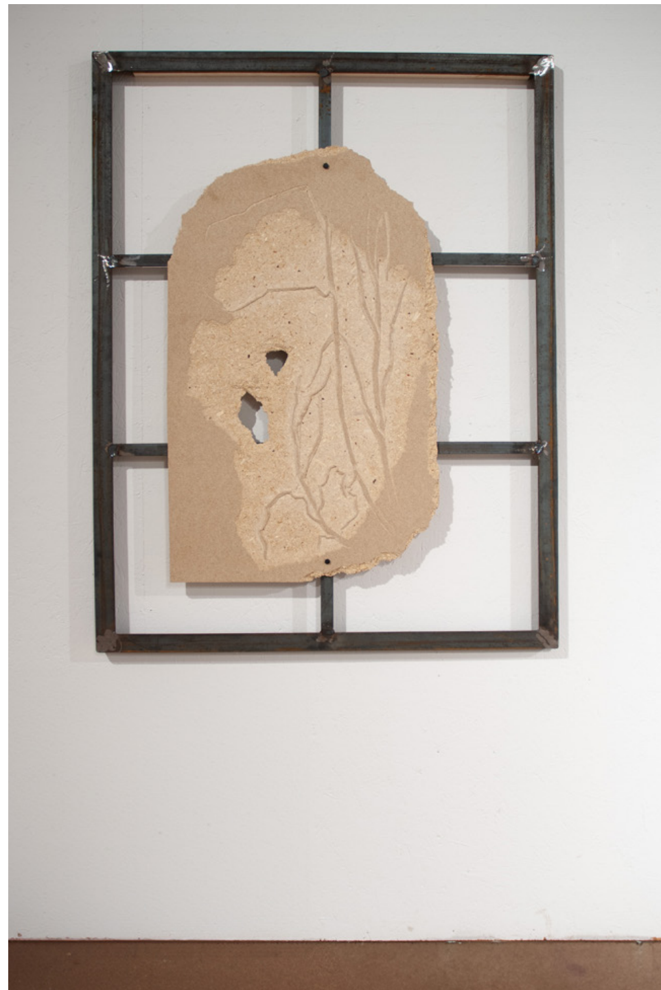
Image description: Documentation from residency presentation at KKV Bohuslän, 2024.